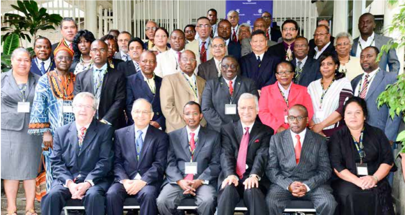
Group photo of Delegates at the last CEN Conference in Nairobi, Kenya.

The Commonwealth Electoral Network (CEN) was established in May 2010 in Ghana, after it was first endorsed by Commonwealth Heads of Government in 2009. Its aim is to facilitate experience sharing, create peer support mechanisms and embed good electoral practices in the Commonwealth's 53 member countries. Former Commonwealth Secretary-General Kamallesh Sharma said: "The Commonwealth's commitment to the network is recognition at global level of the pivotal role played by election management bodies in ensuring integrity of elections in member countries."