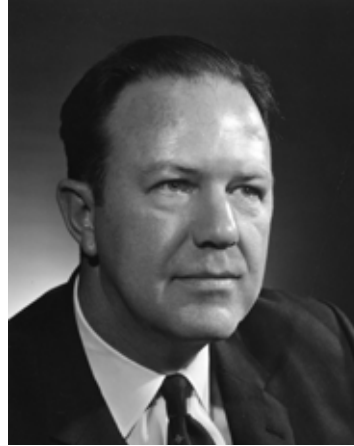
Former Secretary General Arnold Smith