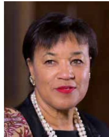
Secretary General Patricia Scotland Present