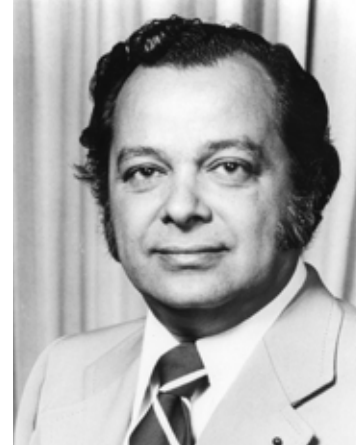
Former Secretary General Sir Shridath "Sonny" Rampha