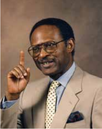
Former Secretary General Chief Emeka Anyaoku