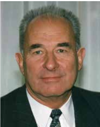
Former Secretary General Sir Don McKinnon