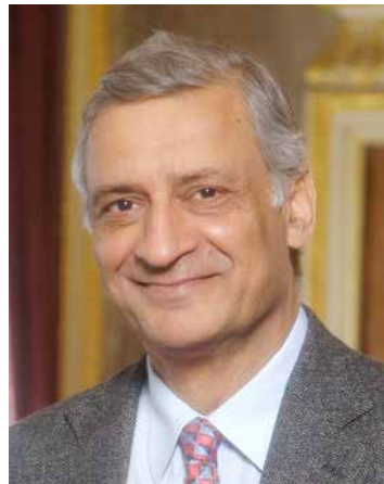
Former Secretary General Kamallesh Sharma