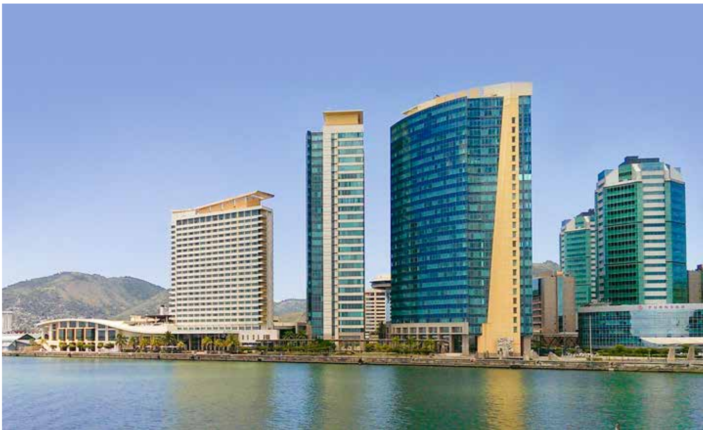
Waterfront Photo, in Port of Spain Trinidad and Tobago. The CEN Conference takes place at the Hyatt Regency Hotel located at this venue.

Electoral commissions from across the Commonwealth will meet in Port-of-Spain, Trinidad and Tobago, for an International Conference to advance Commonwealth Principles in Elections Management.